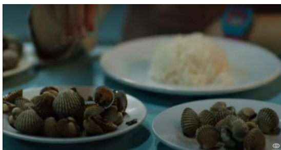
Figure 1. Scene in the film at 08:22 seconds

This illustrates the condition of the intimate areas of women whose conditions are similar to those of a virgin. First if the condition of the vaginal mouth is still tightly recognized as a virginity. This is the same as the condition of a closed clam which indicates that it is still fresh. Vice versa, when the condition of the mouth of the vagina is wide, it indicates that he has never had intercourse. This is the same as the state of open shells indicating it is not fresh.