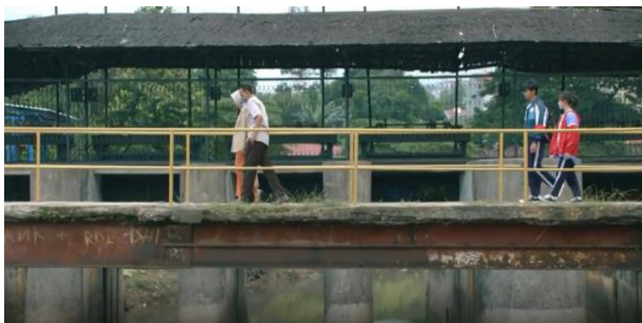
Figure 6. Scene in the film at 42:09 seconds

Here is where Dara learns of life in one trip over the bridge. Described about the hustle and bustle of life that Dara, had never met when she was a child of a rich family. When the privileges that were inherent in her from birth have to be released to take responsibility for her pregnancy, she feels various emotions. Like when he has eye contact with a husband and wife who are fighting, or someone who dies makes him begin to understand that his life in the future will not be easy anymore. If it is understood that this scene actually teaches teenagers to see the reality of domestic life, it is not as easy as playing house. This should also be added to sex education for adolescents. They have to understand the big responsibility when they dare to cross the line, realities that are far from the fairy tales of kings and queens, so that they are able to create limits on themselves.