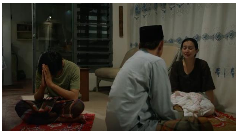
Figure 11. Scenes in the film at 53: 29-59: 03 seconds

Perversion of sex is considered a great disgrace that will lead to tremendous shame. The cynical looks and ridicule make the family feel a loss of self-esteem. But strangely, only Bima's family experienced criticism from his neighbors. Meanwhile Dara's family does not accept external conflicts, but rather internal conflicts between family members.