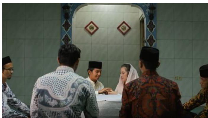
Figure 12. Scene in the film at 1:03:04 seconds

Early marriage is still considered a solution for pregnant teenagers. This is considered the best solution, considering that children who are already in the womb need parental assistance. Bima and Dara also did this. This marriage was proposed by Bima's parents who have a religious background. Initially this was opposed by Mrs. Dara, who thought that her child was too early to marry. However, this marriage continued because almost all family members agreed.