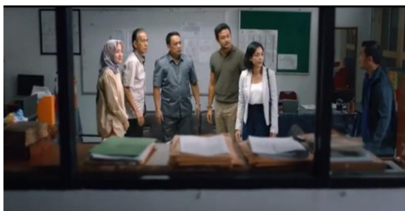
Figure 5. Scene in the film at 33:47 seconds