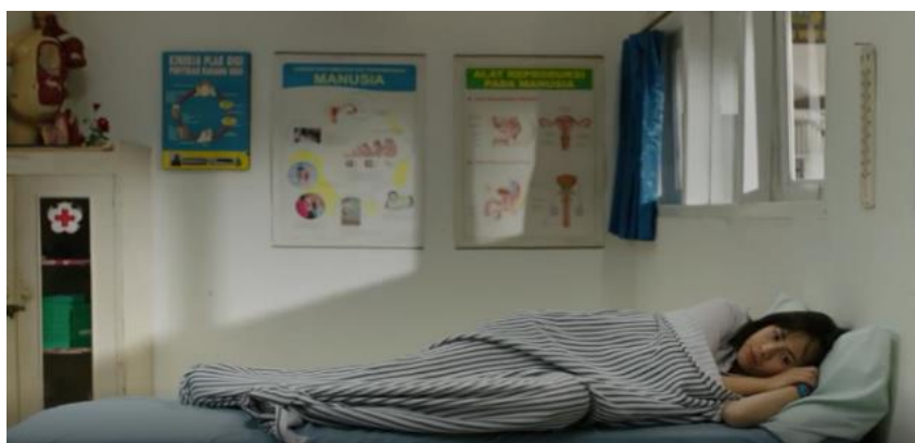
Figure 4. Scene in the film at 14:57 seconds

There is a scene where Dara is forced to leave lessons to take a break at the UKS because of her pregnancy. There Dara cried because she felt the difficulty of being a pregnant woman. On the wall of the UKS there are posters about the structure of the reproductive organs of women and men. This seems to insinuate the lack of socialization about sex education which is only done through reproductive posters.