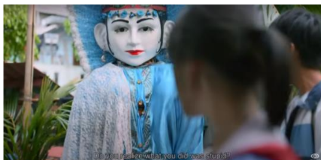
Figure 7. Scene in the film at 42:44 seconds

Ondel-ondel is a typical art of Jakarta in the form of a replica of the form of women and men. In ancient times, ondel-ondel was used to ward off evil spirits. Red-faced ondel-ondel is the embodiment of a man and fatherhood while the white-faced ondel-ondel is the embodiment of a woman and motherhood.