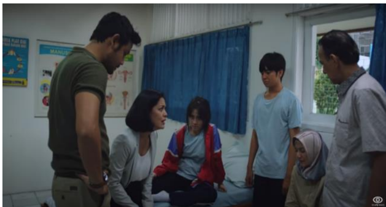
Figure 8. Scene in the film at 38:24 seconds

These ondel-ondel often appear when Dara or Bima are confused, worried and anxious. Except when they are eating shellfish, red ondel-ondel who want to enter the stall were expelled by the stall owner. Others appear when Bima borrows money from white-faced ondel-ondel for abortion. Dara also met white ondel-ondel when she was pondering wanting to make a decision. Both ondel-ondel illustrate the role of fathers and mothers who are never separated from children. Dara and Bima are teenagers who are forced to become parents early. The soul of a parent is actually always present in every individual, if it presents the courage to be responsible and the tenderness to love. Sex education should not only teach about what teens can or should not do, but also family education. To be a parent there are no special subjects at the formal school level, so the solution is for teens to imitate how parents are around them.