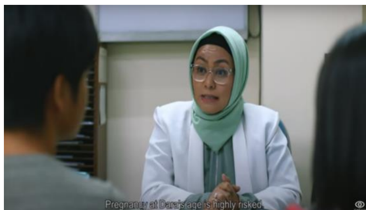
Figure 3. Scene in the film at 47:31 seconds

There are many roles as educators performed by obstetricians in this film. As an explanation of the risks of pregnancy at a young age, as well as about the test pack that was previously misunderstood by Bima. Here the role is very neutral and does not suppress Dara as a teenager who is pregnant out of wedlock. Instead, she gave an explanation of how to maintain a pregnancy to Bima and Dara. In addition, the author also quipped about the lack of sex education which only explains the reproductive system. This can be seen when obstetricians provide counseling to Bima and Dara in their practice room.