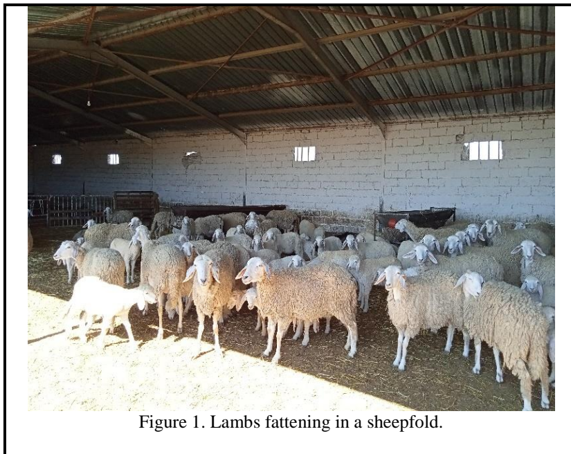
Figure 1. Lambs fattening in a sheepfold.

Our study focused on 43 males aged 7 months and over, sold after fattening. All animals belonging to Ouled Djellal breed, given that it is the dominant breed in numbers terms not only on a national scale, but also in the east country, which constitutes breed cradle (Figure 01). The lambs tracked were identified by an ear tag bearing a number for each lamb tracked.