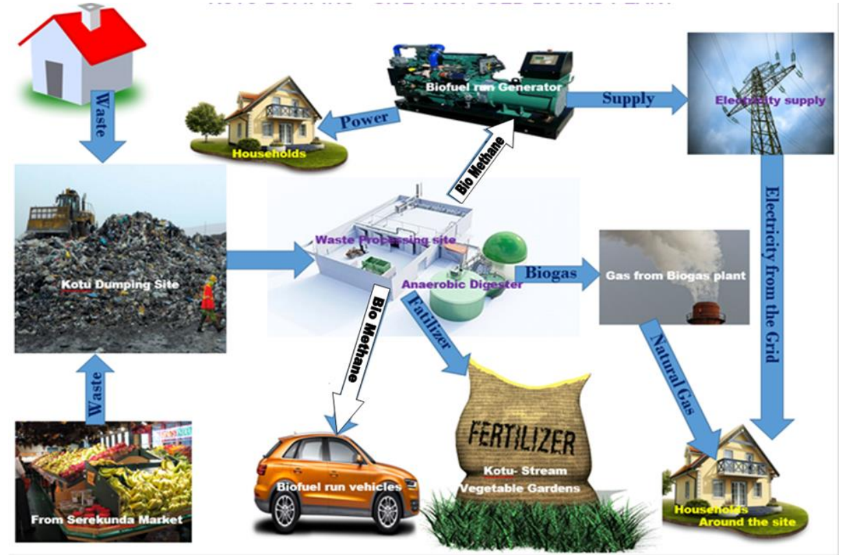
Figure 2. Kotu Dumping—Site proposed biogas plant

The biomethane generated from the plant will run a medium-scale generator that will provide electricity as an energy source for lighting. The electricity supply generated for a few people around the landfill is not that